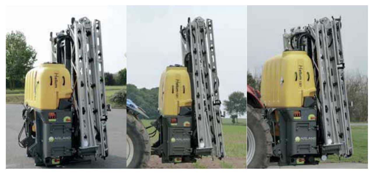
Helium 1000 L ALC3 18 m (3 M arms)