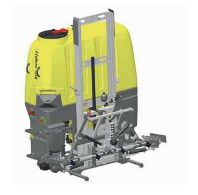
The ALC Boom is an aluminum boom with three widths: 18, 21 and 24 m.

This boom is mounted on a sliding frame equipped with a nitrogen suspension. Each boom arm is equipped with shock absorbers and anti-whipping is hydro-pneumatic as standard.